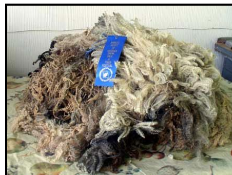
Natural colored 3/4 BFL x 1/4 BL yearling fleece