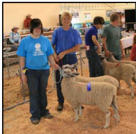
1 st place - Pair Ewe lambs