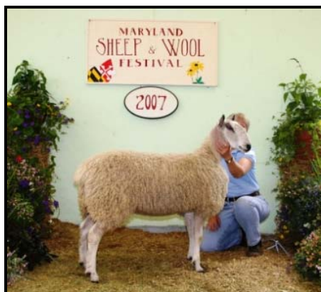
CH WLW Ewe 'Belhaven'